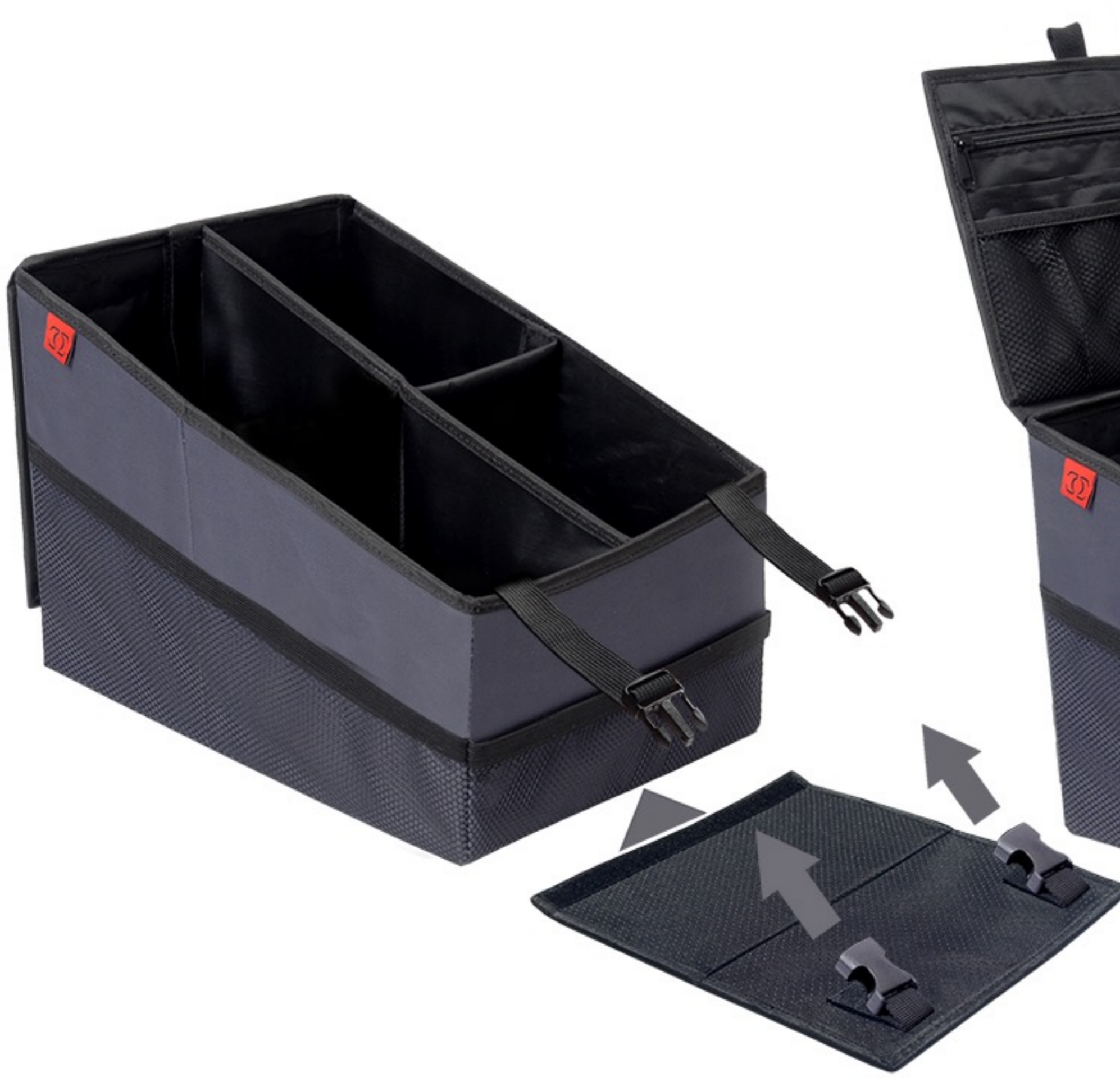
VARIATION2 (Travel table)

Tuck the front lid between the mesh pocket and the elastic band and connect it under the body.