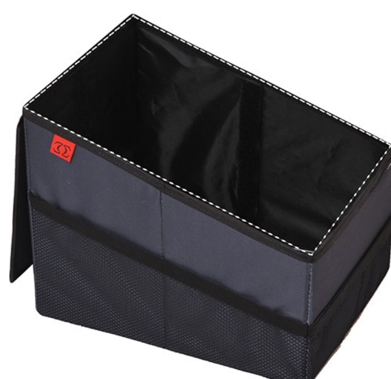
Insert the floor inlay