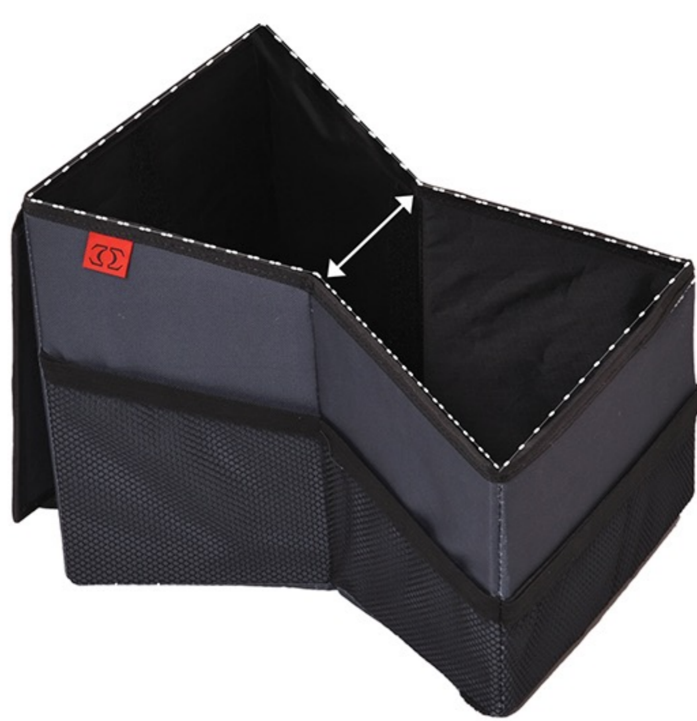
Unfold the body